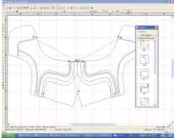
The order of sewing data to be sewn can be easily checked and changed.