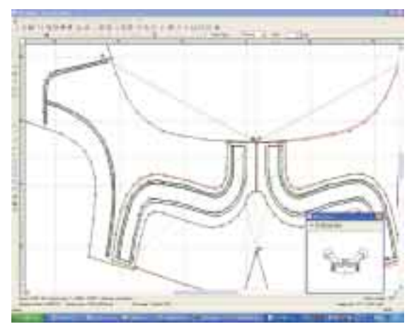
An image is displayed on the screen. You can create data while checking the image. You can enlarge and edit a part of the data while checking the entire design.