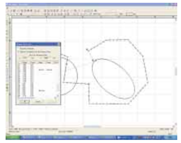
Sewing data can be accurately and easily created and modified by a batch entry function of numeric data (unit: mm).