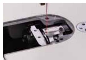
Rotary-type thread trimmer

The rotary-type thread trimmer performs constant and stable thread trimming regardless of materials of threads with easy adjustment.