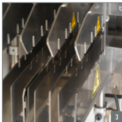
1. Microflex curtain hook