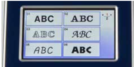
Built-in font styles