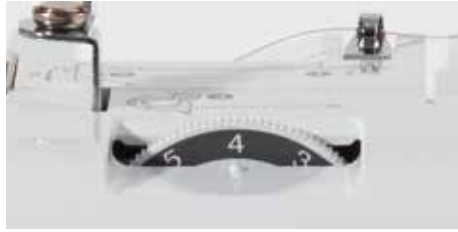
Adjustable thread tension