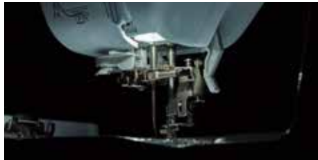
Super bright LED light