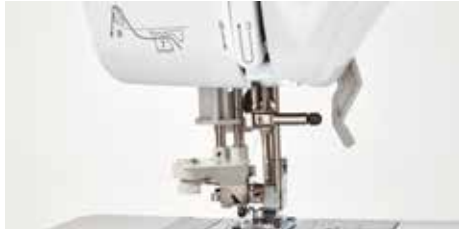
Advanced needle threading system