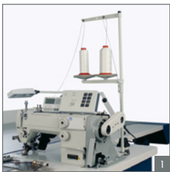
1. Top and bottom feed including intermittent puller transport